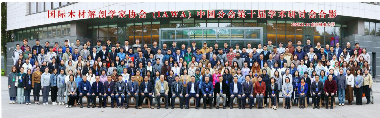
Photo of participants of the 10th IAWA China group annual meeting