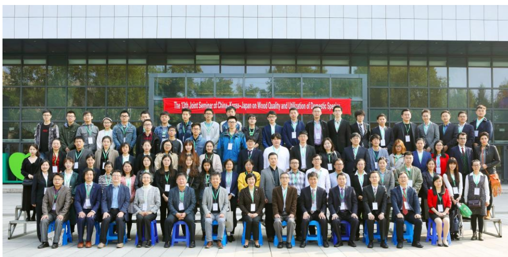
Delegates of the 13 th Joint Seminar of China-Japan-Korea on Wood Quality and Utilization of Domestic Species in front of the new library of Nanjing Forestry University.